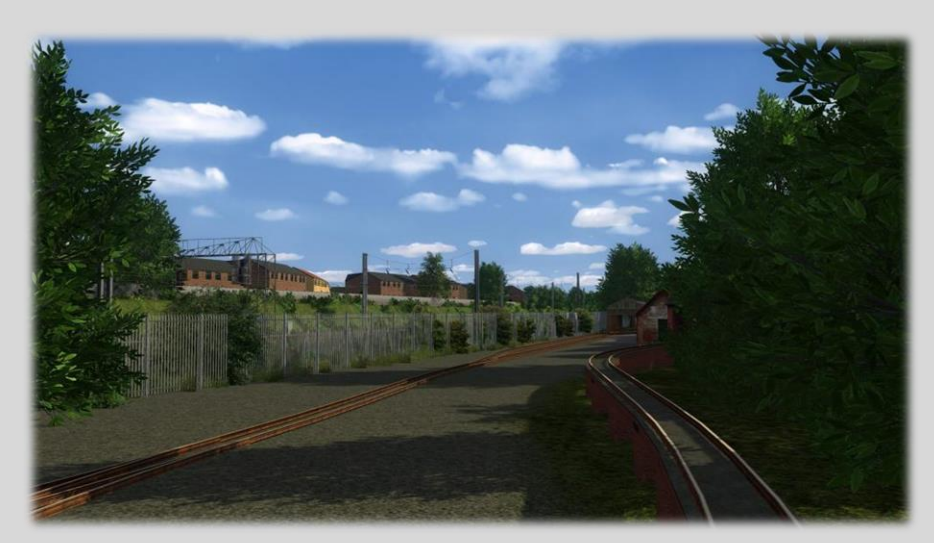
York Small Model Engineers Club