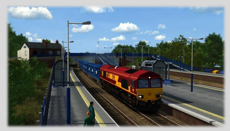
Church Fenton Station