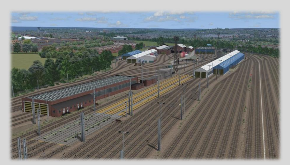
Neville Hill Depot