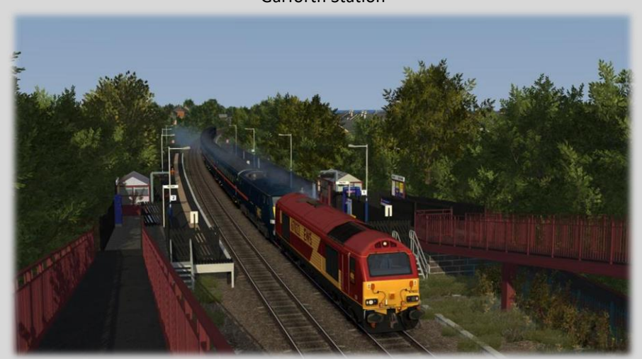
East Garforth Station