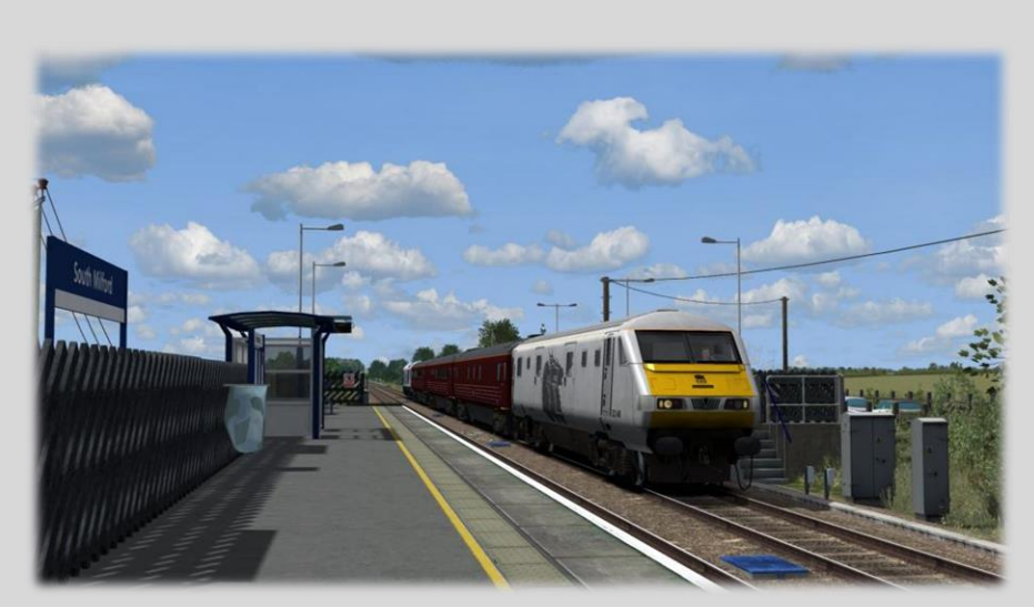
South Milford Station