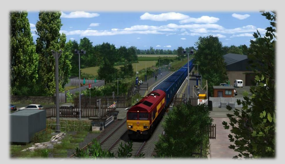
Sherbern in Elmet