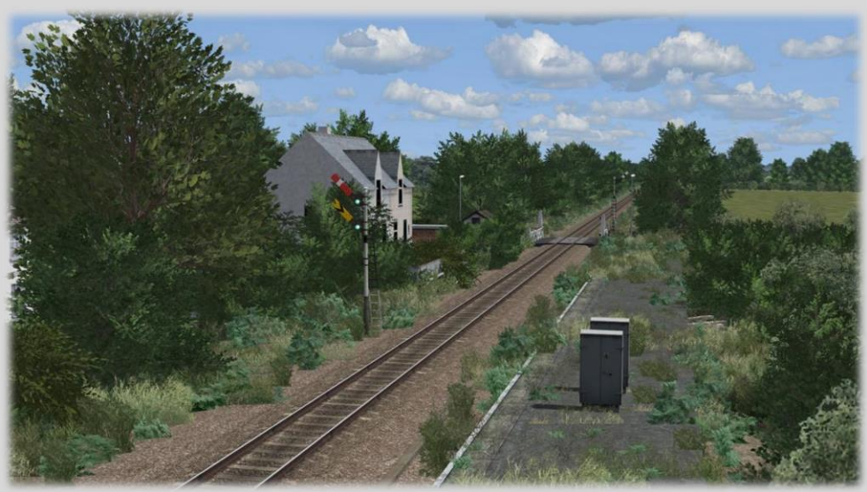
Between Poppleton and Hammerton