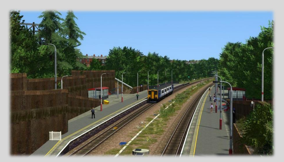
Cross Gates Station