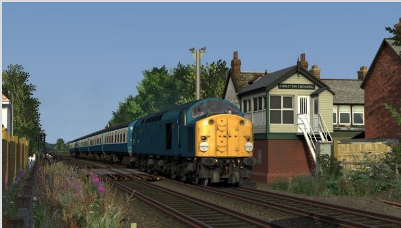
Carleton Level Crossing