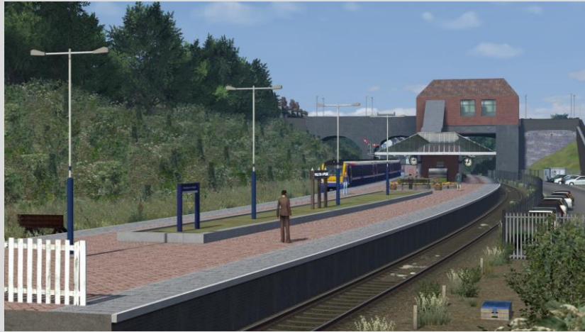
Poulton - le - Fylde Station