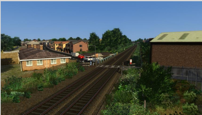
Holts Lane Foot Crossing