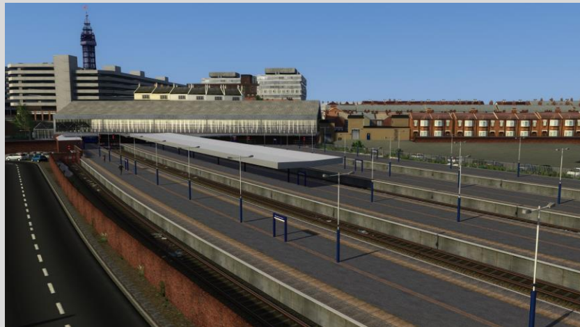
Overview of Blackpool North Platform