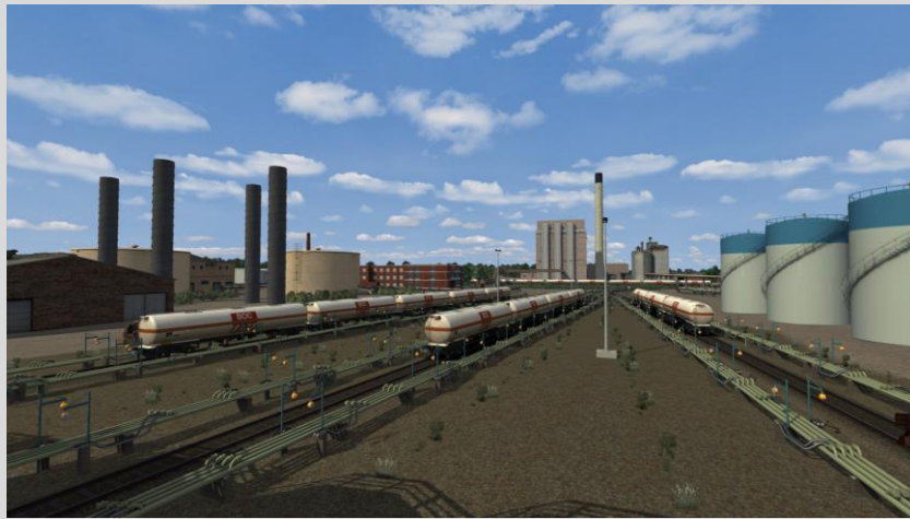
Burn Naze ICI Terminal