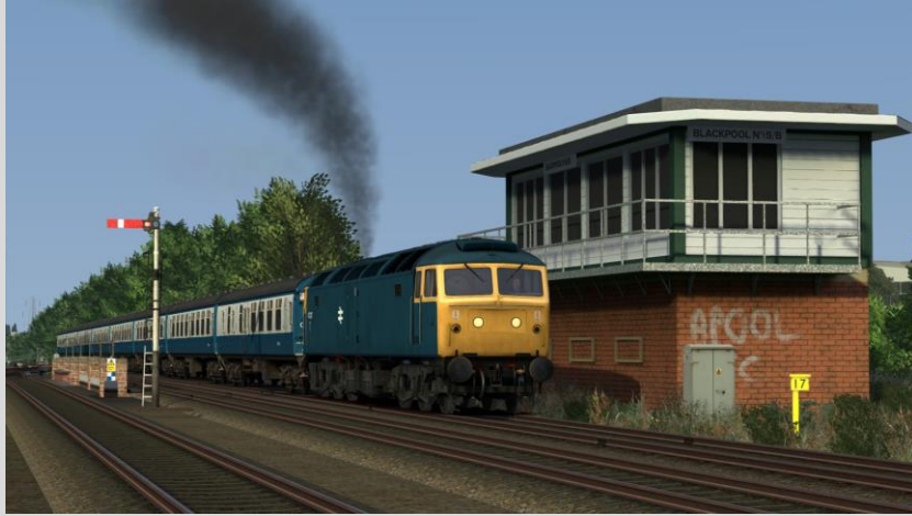
Blackpool North No.1 Signal Box