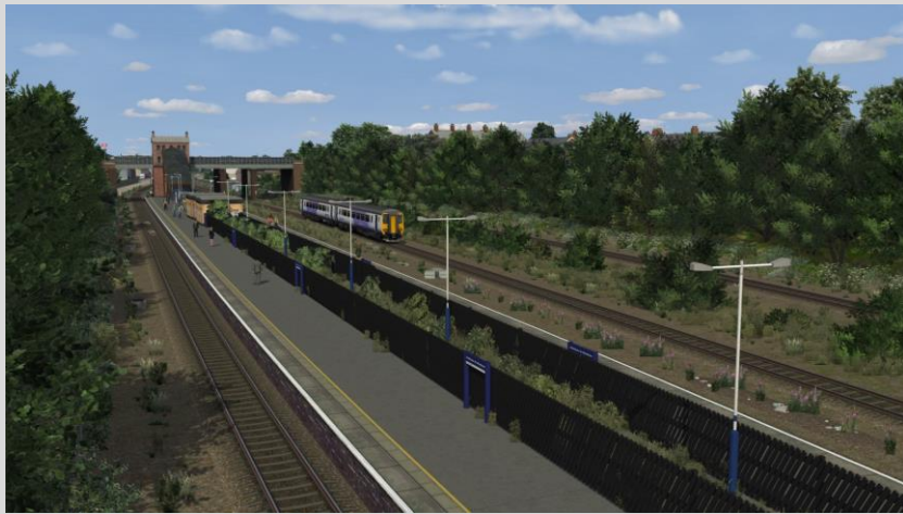
Kirkham Station seen from the Fast Lines