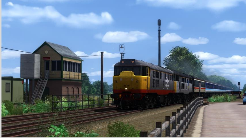
Salwick Signal Box