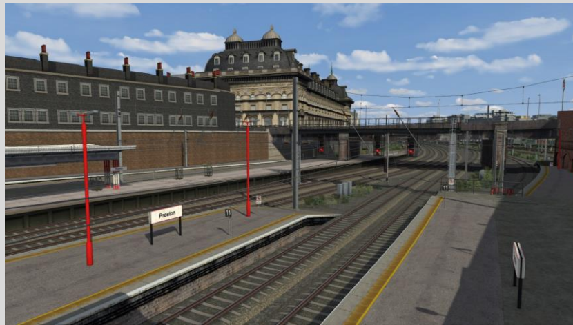
Looking north Preston Station

Simple Quick drives without AI at various locations.