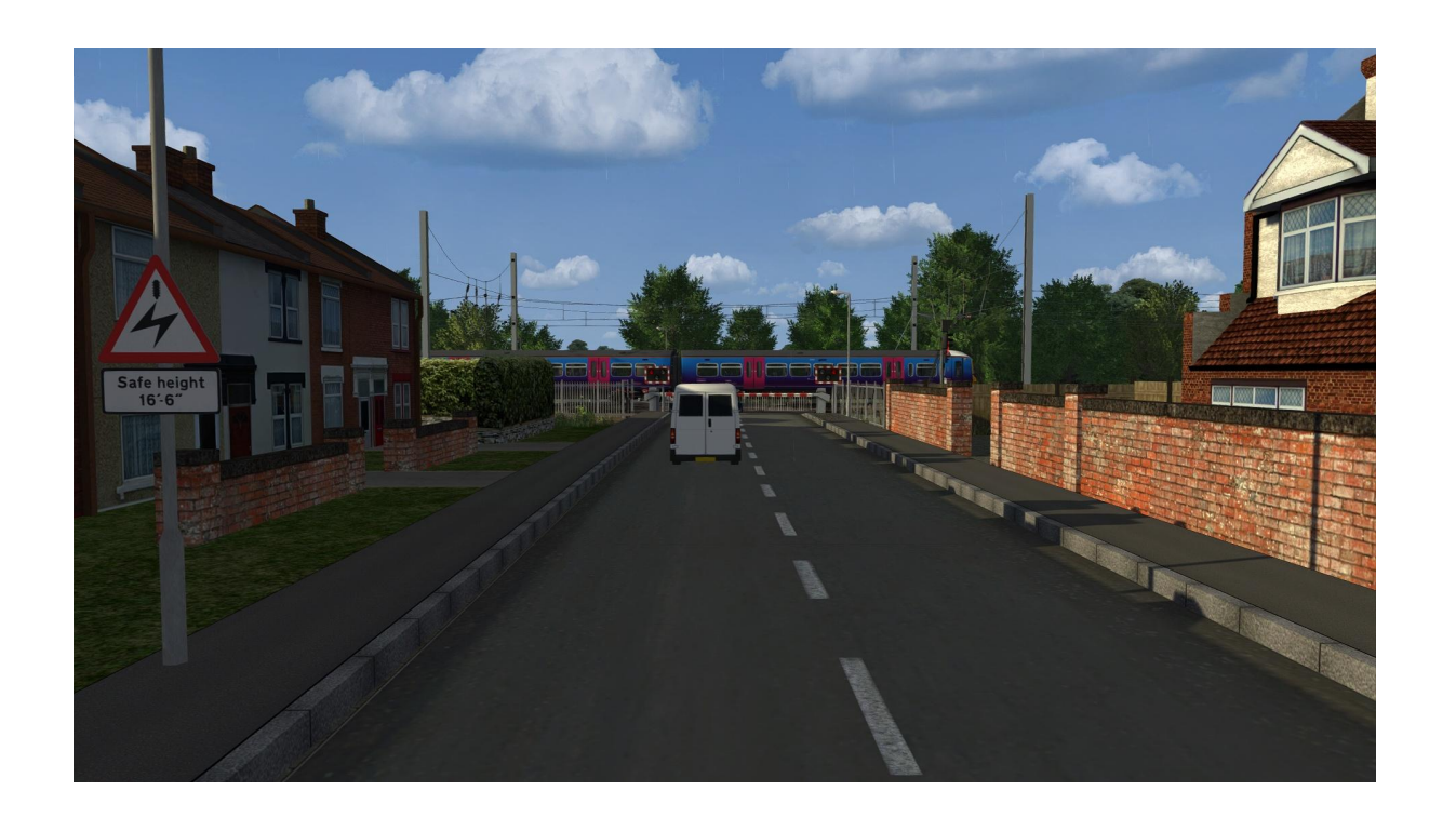
From 4 Aspect Simulations