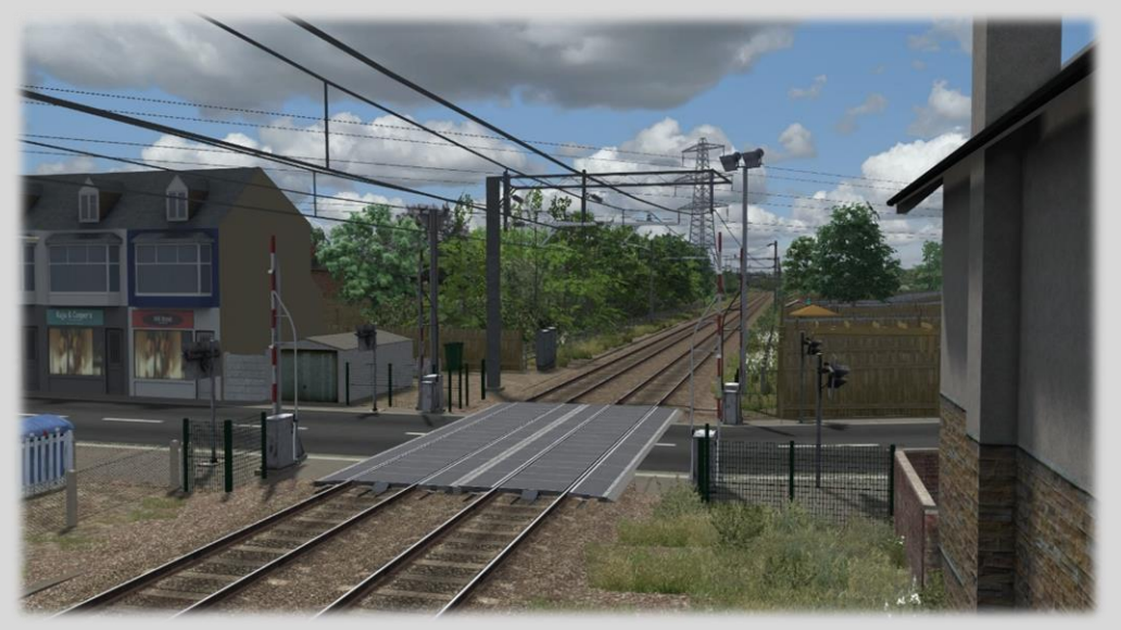
Carleton Level Crossing