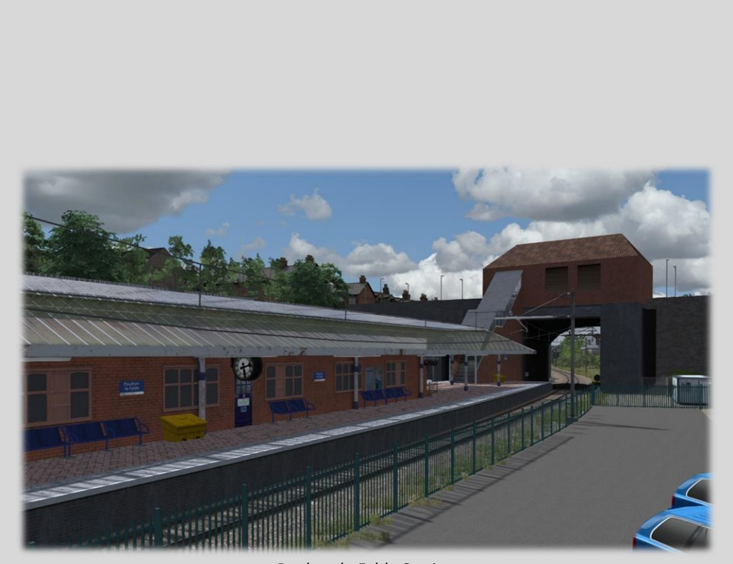
Poulton le Fylde Station