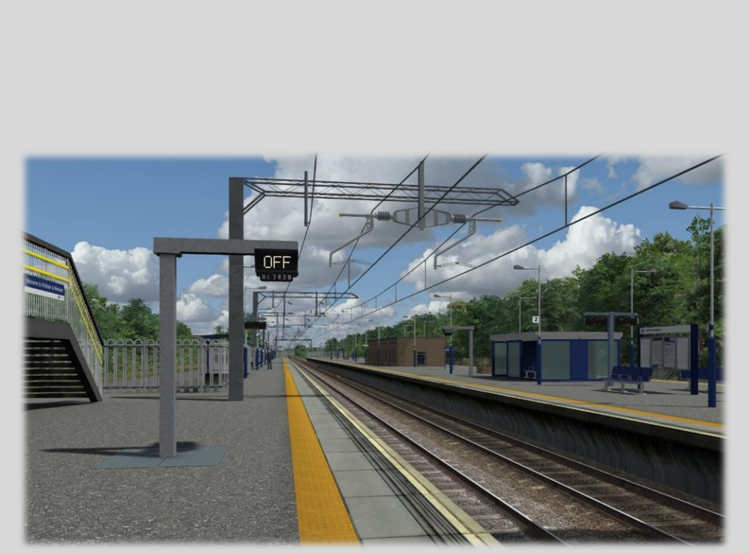
Kirkham and Wesham Station