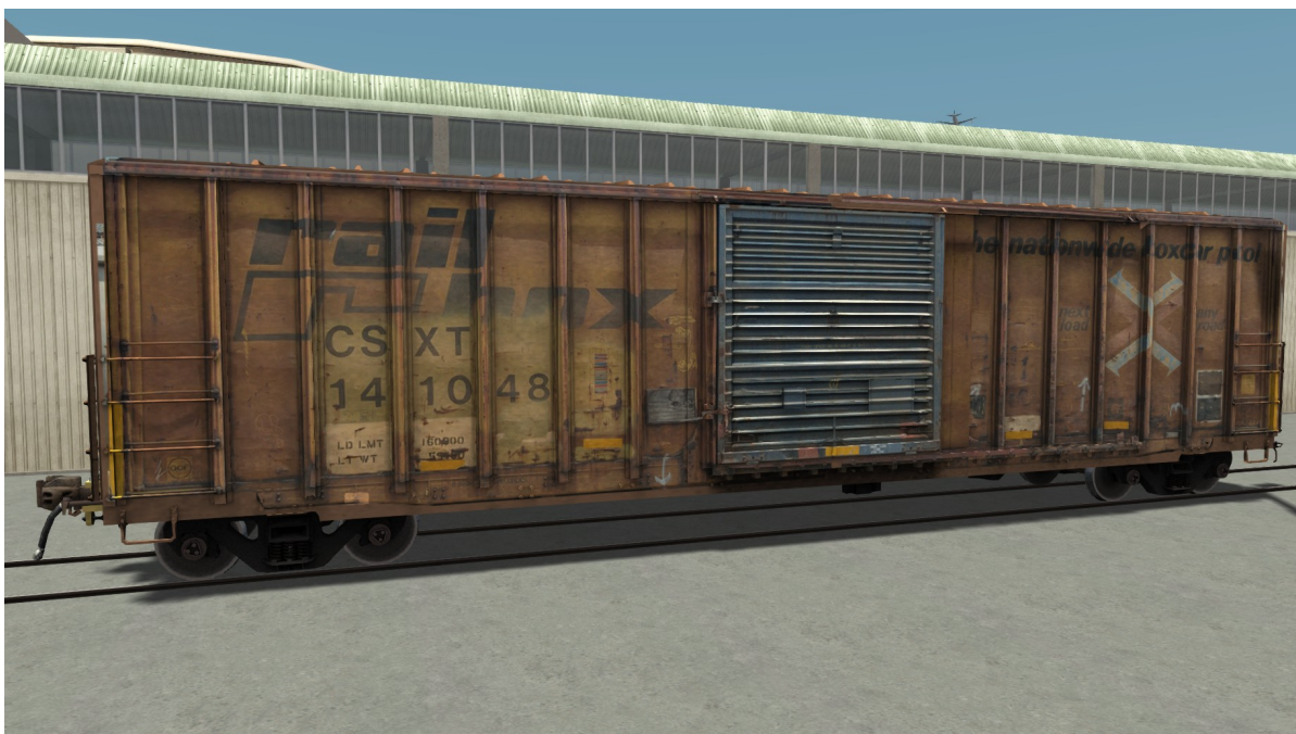
FMC Box Car (CSXT 141048)