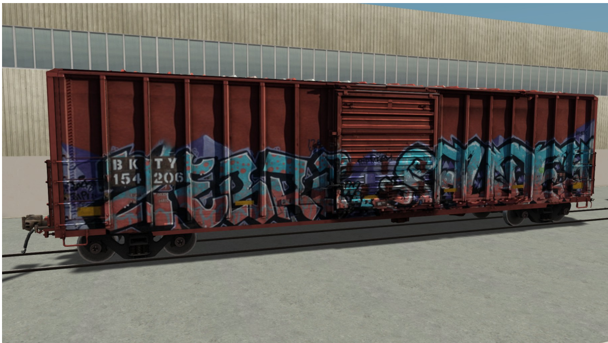
FMC Box Car (BKTY 154206)