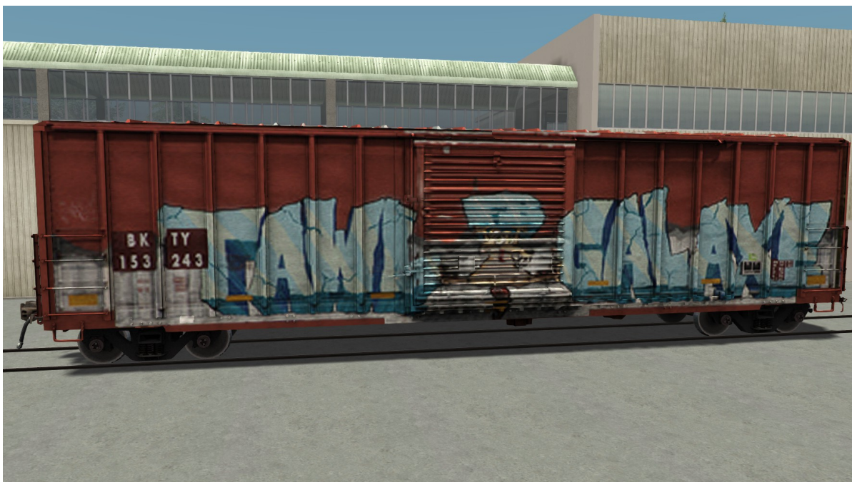
FMC Box Car (BKTY 153243)