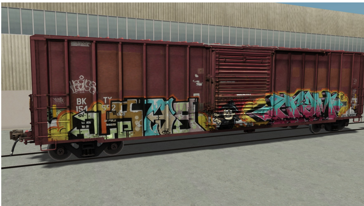
FMC Box Car (BKTY 154552)