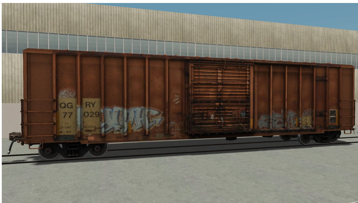
FMC Box Car (QGRY 77029)