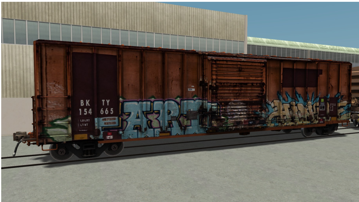
FMC Box Car (BKTY 154665)