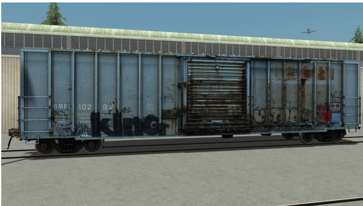
FMC Box Car (GMRC 10292)