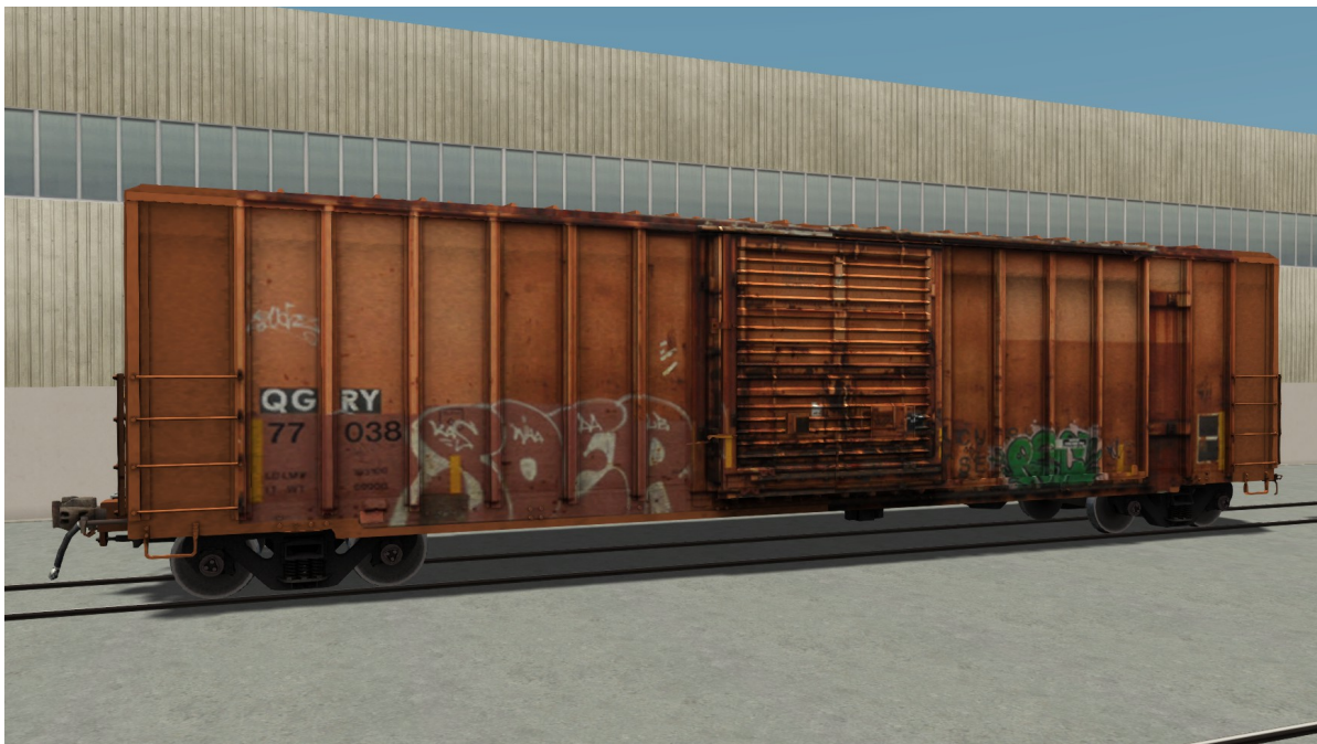
FMC Box Car (QGRY 77038)