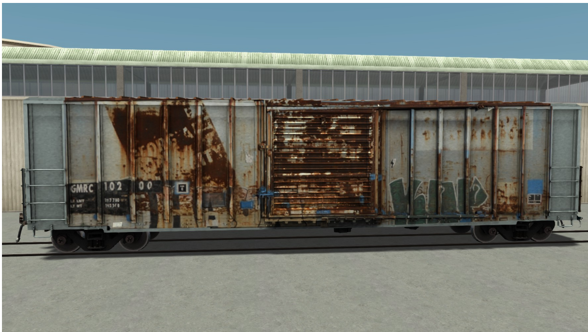
FMC Box Car (GMRC 10200)