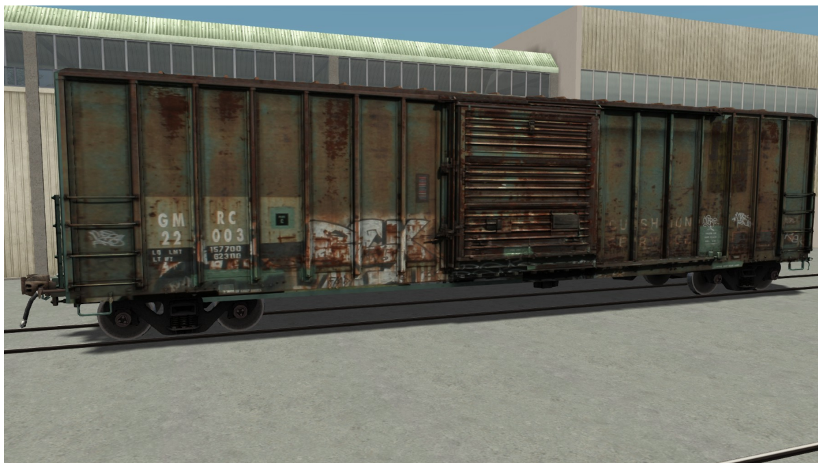
FMC Box Car (GMRC 22003)