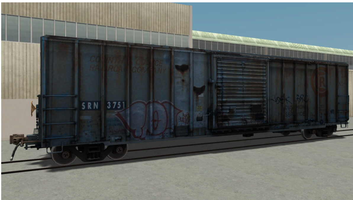
FMC Box Car (SRN 3751)