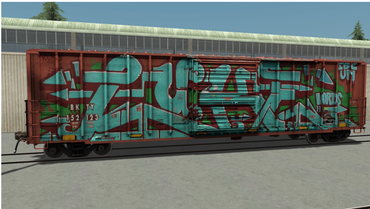
FMC Box Car (BKTY 152123)